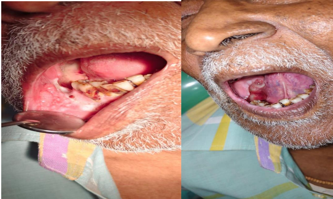
LESION ON ALVEOLAR MUCOSA